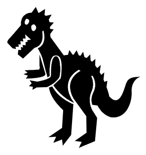
Have a dino-mite time at the Tooele City library!

Remember children's story time every week at 11 am and children's crafts each Friday from 3—5 pm. Check with the library for any special story times or other special events. For more information on these and other library programs, check the website <a href="http://tooelecity.org/tcl/">http://tooelecity.org/tcl/</a> library.html>, call 435-882-2182, or visit us at 128 West Vine Street, Tooele, Utah.